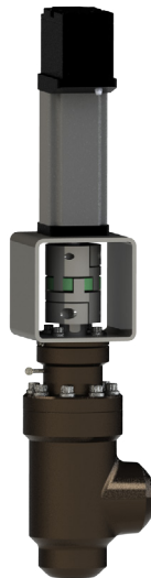
P2E Choke Valve