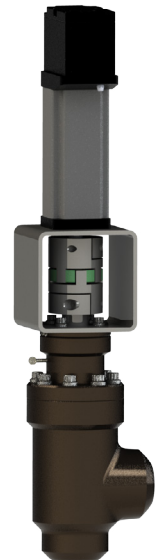
P25E Choke Valve